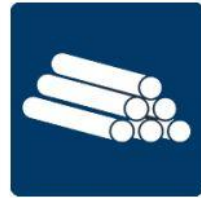
PIPES, PROFILES AND WIRES