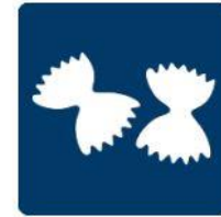
PASTA AND BREAD