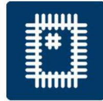
FIBRE AND STRAP