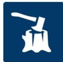
WOOD AND ENERGY