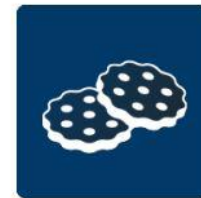
CAKES AND COOKIES